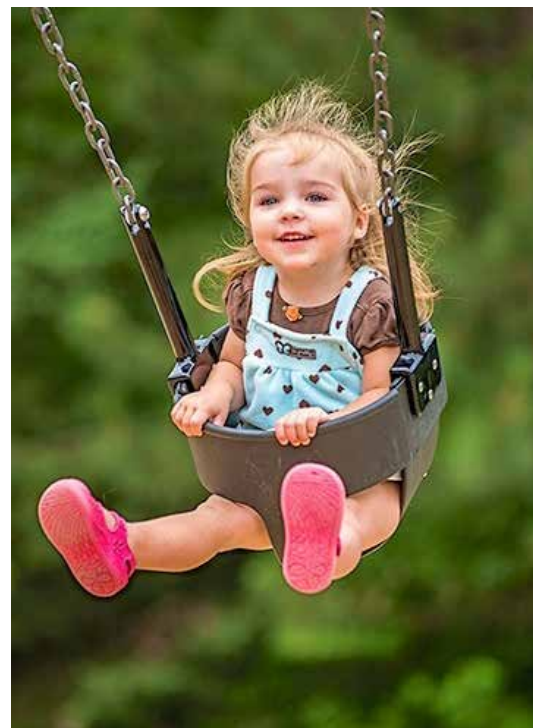
FROG Park toddler swing.